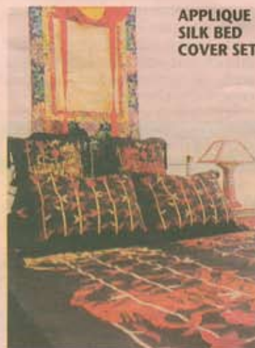
APPLIQUE SILK BED COVER SET