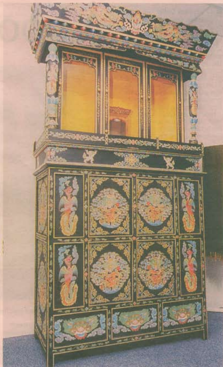
HIGHLY ARTISTIC: Altar cabinet in two parts at RM20,000