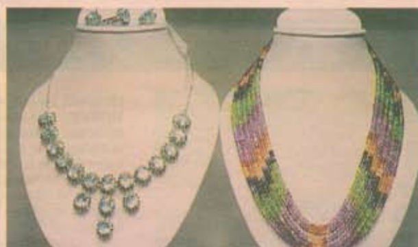
EXQUISITE: Beautiful gemstone necklace sets from Rajasthan. Blue topaz (left) and a mixture of gemstones (right)